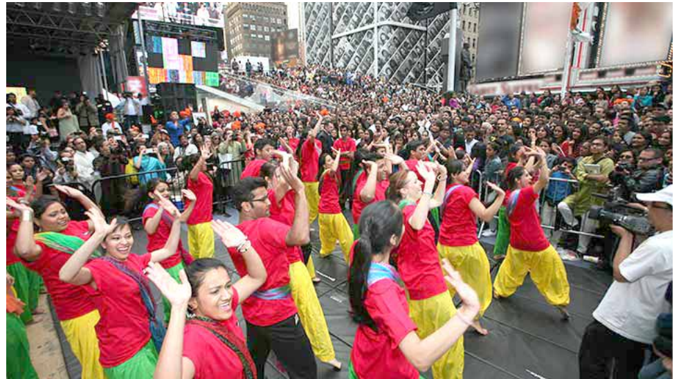
The biggest Diwali celebration of North America at Times Square, New York

You can read the full article here: www.sbeinc.com/cms.cfm?fuseaction=news_detail&articleID=863&pageID=25