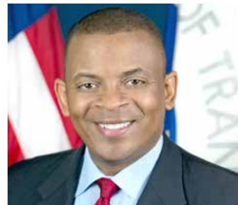
U.S. Transportation Secretary Anthony Foxx

The GROW AMERICA Act would authorize $5 billion over four years for much-needed additional TIGER funding to help meet the overwhelming demand for significant infrastructure investments around the country and provide the certainty that states and local governments need to properly plan for investment. The $302 billion, four year transportation reauthorization proposal would provide increased and stable funding for the nation's highways, bridges, transit, and rail systems without contributing to the deficit. The GROW AMERICA Act also includes several critical program reforms to improve the efficiency and effectiveness of federal highway, rail, and transit programs.