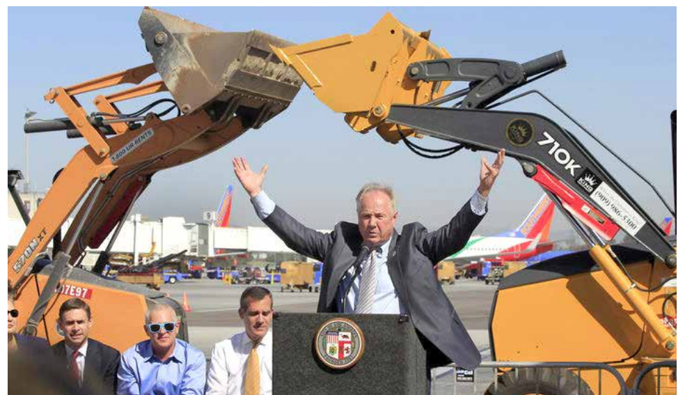
Los Angeles Councilman Tom LaBonge speaks during a groundbreaking ceremony for the LAX Terminal 1 expansion and modernization program in Los Angeles Tuesday. It is part of an ongoing modernization of all the domestic terminals at the airport.